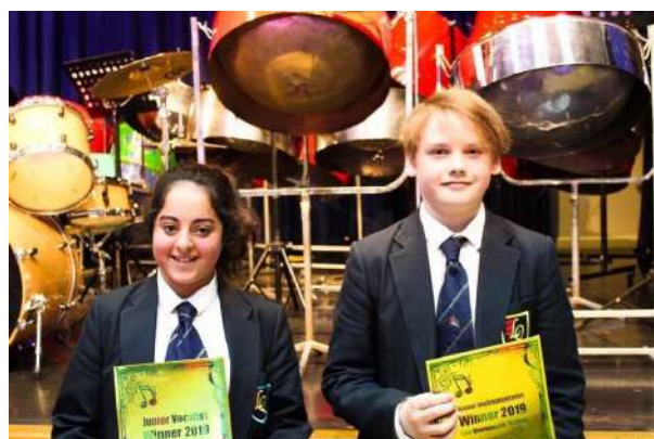
Winners of the Junior House Music competition

Our inaugural Junior House Music was launched this year. The aim of this new competition is to shine a spotlight on solo performers, many of whom are working diligently in their own time on their musical talents but are largely unknown to the school as a whole. I very much look forward to seeing this event grow in scale in future years.