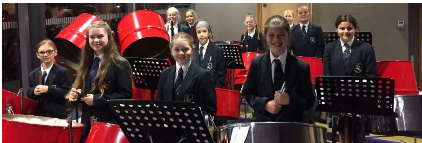
The school steel band

The Steel Bands have been part of the musical life of Les Quennevais and the Island for the past 20 years. We started two new bands this year, one in Year 7 and one in Year 8. They have worked very hard indeed, performing at various school events as well as across the Island. Gigs this year have included playing at The Royal Yacht as part of International Women's Day, the Barclays Jersey Boat Show, La Moye School's summer BBQ and a number of private functions. We look forward to starting next academic year performing at the Wilderness Ball, honouring Durrell's 60th Anniversary in September.