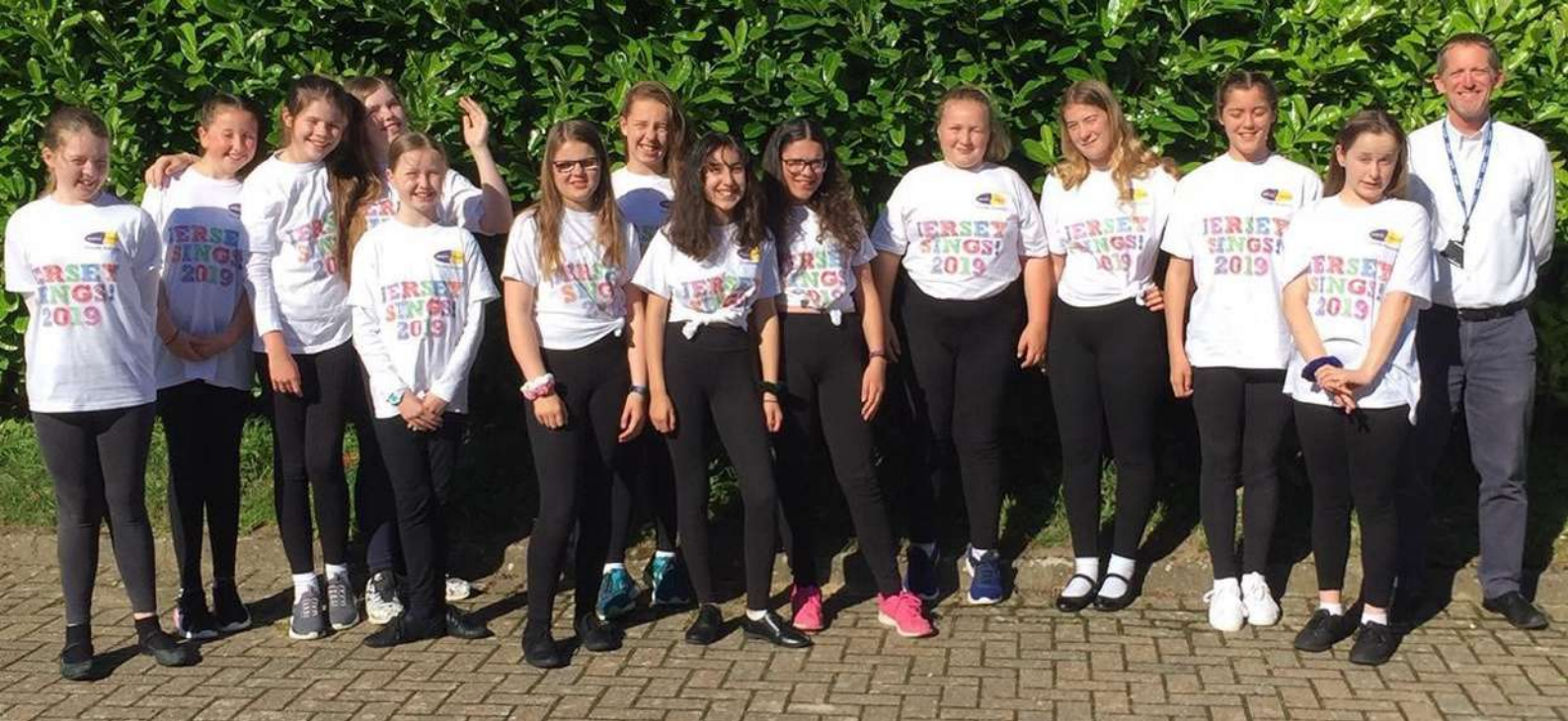
The Les Quennevais Jersey Sings Choir

Les Quennevais School proudly took part in Jersey Sings this term. When we started I didn't quite realise the sheer quantity of music and words that the pupils had to learn off by heart (including a whole song in Jèrriais). We rehearsed lunchtimes and after school, and the Year 7 pupils involved put in a huge amount of effort in their own time to ensure that when the performance day came, they were confident, assured and a credit to the school.