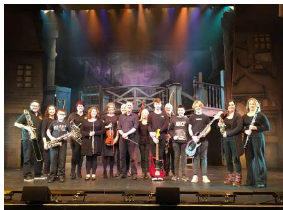
The incredible orchestra for 'Oliver!'

We started with the Nearly Christmas Concert back in December and this was closely followed by the all-encompassing production of 'Oliver!' at the Jersey Opera House in January. I have spent many hours in the orchestra pit at the Opera House as a musician, but this was my first time there as MD, and I loved it! The orchestra that came together was a mix of pupils and local musicians who volunteered their support and considerable skills. The pupils rose to the occasion and gained invaluable experience working alongside such experienced and supportive musicians. I have just started looking at the music for our next production - Annie . Here we go again!